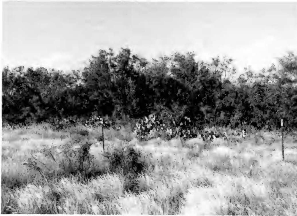
Fig. 3. Dense mesquite brushland in floodplain of the North Concho River.